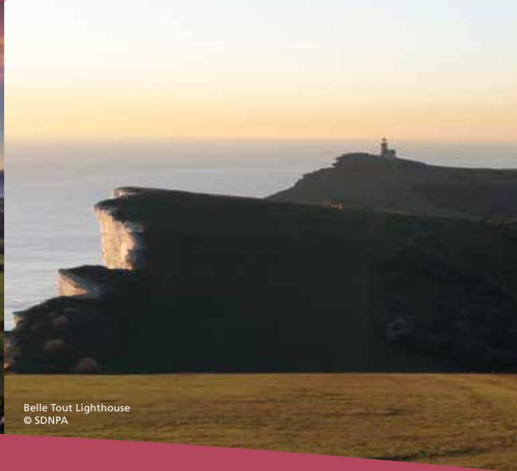
Belle Tout Lighthouse