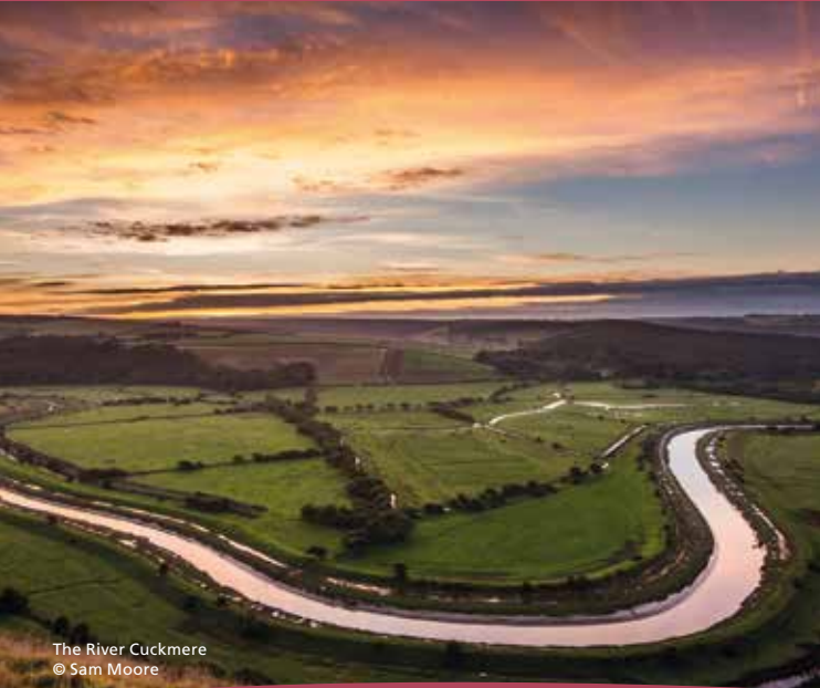
The River Cuckmere